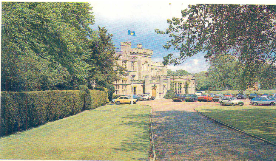
A visitor's first glimpse of the mansion at Research Department, Kingswood Warren. Fortunately, most of the trees along the driveway survived the big storm of October 1987 but a hundred and twenty-three others were blown down and many more disfigured.