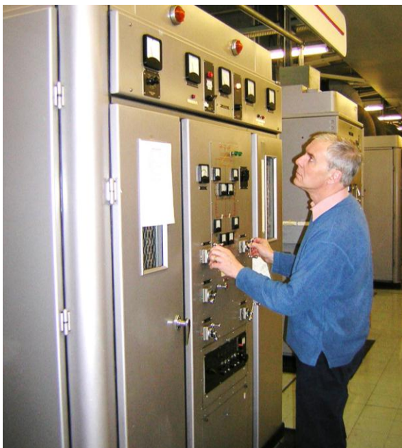
Sender 96 at Woofferton being tuned by the author for its very last transmission prior to scrapping in 2006