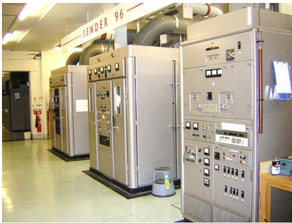
General view of a BD272 installation showing, left to right, modulator, RF and H1100 driver cubicles